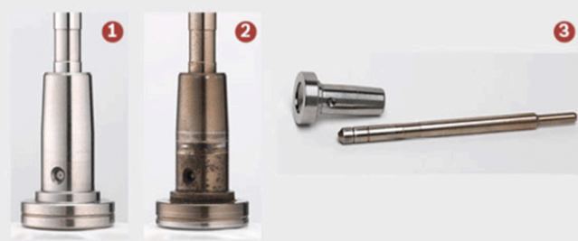
Tear-down findings from Bosch testing process