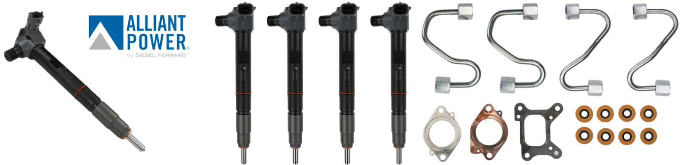
AP54800 & AP54801

All new products are backed by Alliant Power's 24-month, unlimited mileage warranty, as well as Alliant Power's best in class technical support.